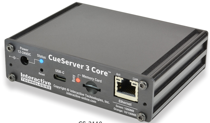
CS-3110 CueServer 3 Core

The CueServer 3 Core version (CS-3110) is the most cost-effective of the Core series, providing the main CueServer CPU and Gigabit Ethernet, without the extra I/O options. If a project is based solely on DMX-over-Ethernet and other network protocols, the CS-3110 is a powerful show controller without the unnecessary extras.